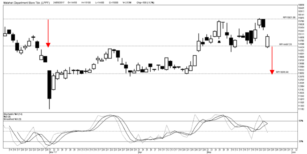
Kinerja saham LPPF

Danareksa research report are also available at Reuters Multex and First Call Direct and Bloomberg